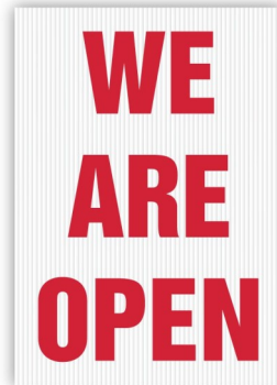
#902 29" x 41"