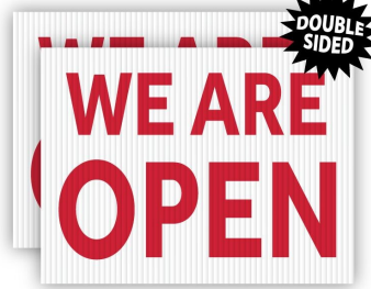
#900 24" x 18"