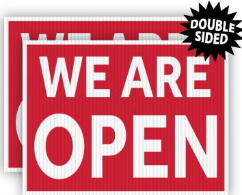
#901 24" x 18"