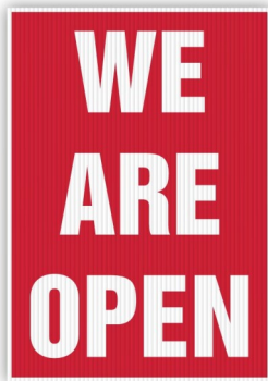
#903 29" x 41"